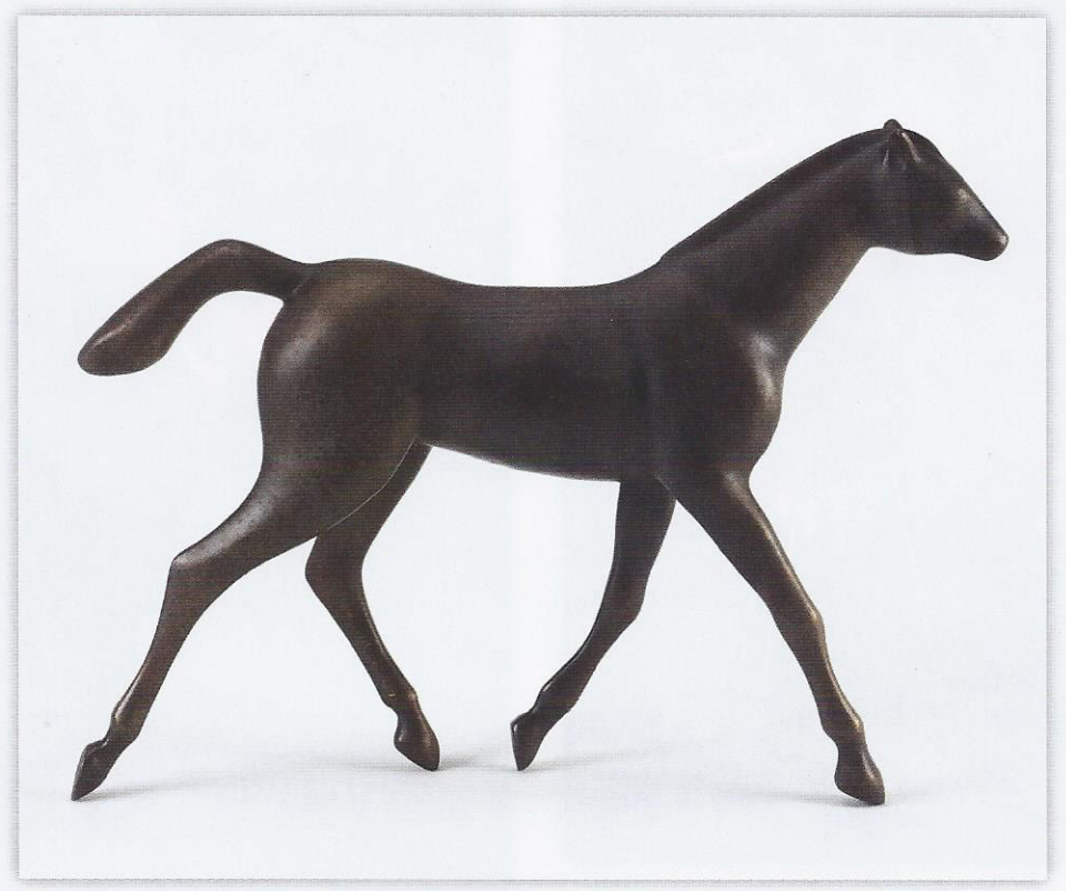
Gwynn Murrill, Little Horse Trotting, bronze, 13 x 17 x 3.

Veteran Western Visions painter de Groot has selected three pieces—two of birds and one of a bison—to present in this year's exhibition. Widely recognized for his naturalistic portraits of birds against lush, enigmatic backgrounds, he has incorporated the same style into his Wyoming-inspired bison depictions. De Groot is especially "honored and flattered" to be named the Wild 100 featured painter.