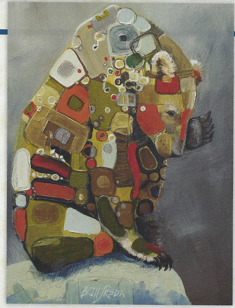
Britt Freda, Ursus Horribilis, acrylic/graphite, 12 x 9.